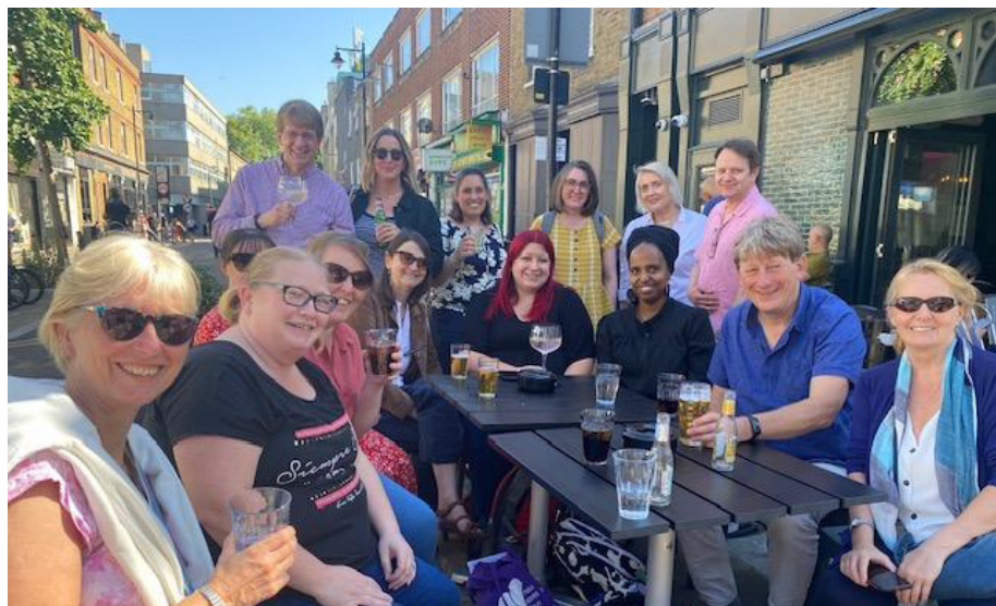
SE PCF Conference June 2024

And finally, thank you to all the South East PCFs, it has been another great year of information sharing and feedback when you are all so incredibly busy, and especially for all the support and laughter. As always, you are all amazing.